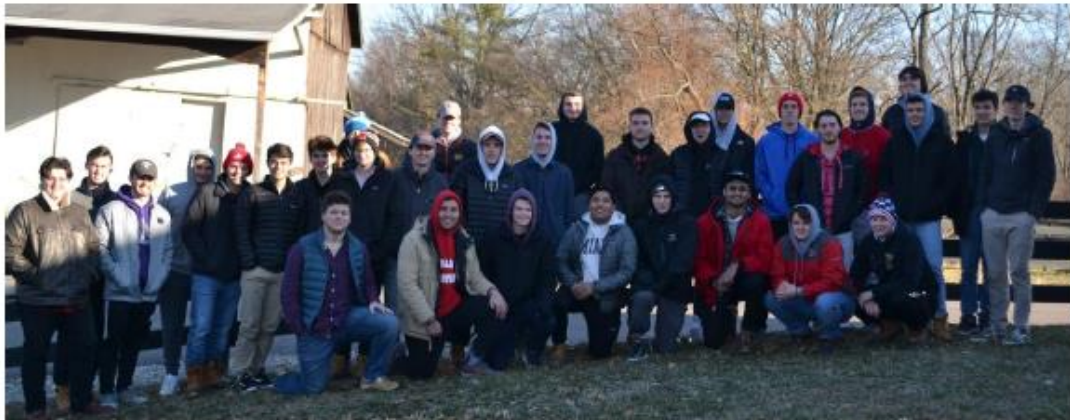
Chi Psi Fraternity Service Day, Forest Run MetroPark – Timberman Ridge Area February 22, 2020