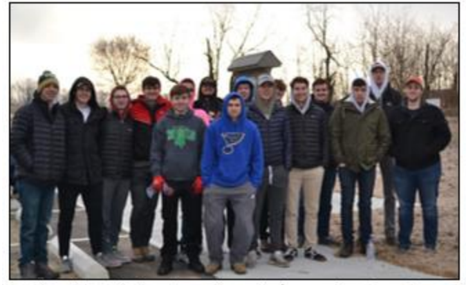
Beta Theta Pi Fraternity cleared non-native species from meadow at Forest Run 3/17/19.