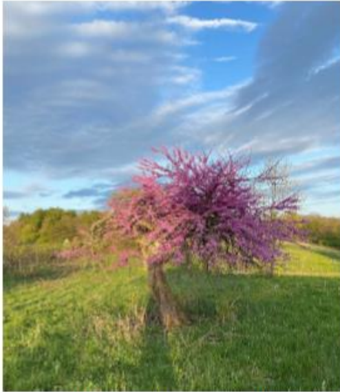
Red bud tree at Elk Creek MetroPark – Meadow Ridge area.