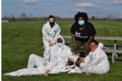
Boys & Girls Club of West Chester at Rentschler Forest – Line Hill Mound area practice fields 4/14/2021