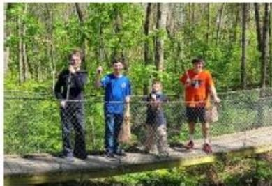
Trail Life troop OH-0414 Trail cleanup at Rentschler Forest MetroPark – Reigart Rd area 4/18/2021