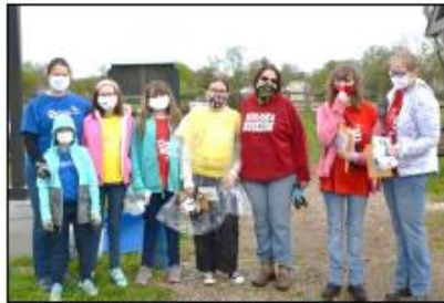
American Heritage Girls troop OH0412 Middletown Community Gardens 4/11/2021