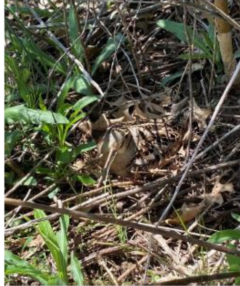
Nesting American Woodcock at Elk Creek MetroPark – Meadow Ridge area.