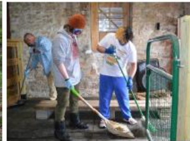
Union Day Therapeutic School Service Day, Chrisholm MetroPark – Historic Farmstead 4/29/2021