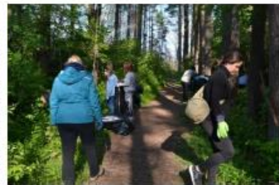
Arrow Adventures, Earth Day Hike, Serve & Yoga Rentschler Forest – Reigart Road area 4/22/2021