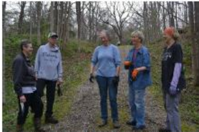
Indian Creek Pioneer Church Spring cleanup 4/10/2021