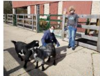
Farm Caretakers at Chrisholm MetroPark - Historic Farmstead 4/12/21