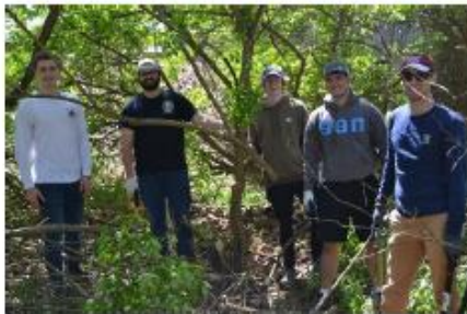
Beta Theta Pi Service Day, Four Mile Creek MetroPark – Mill Race Preserve 4/25/2021