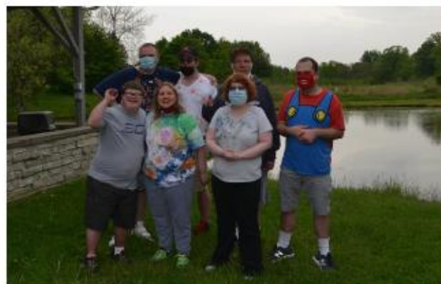
Give Back Crew Service Day at Elk Creek MetroPark, Meadow Ridge area 5/18/2021