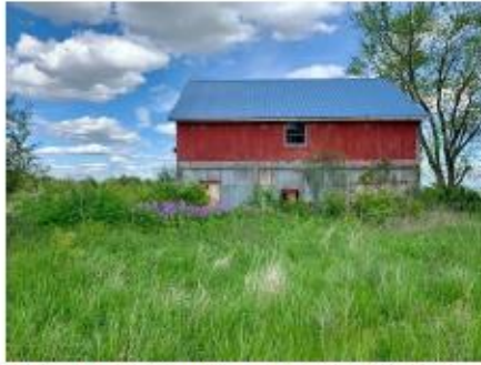
Barn at Elk Creek MetroPark – Meadow Ridge area