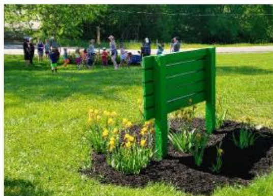
Troop 4269 Service Day, Chrisholm Historic Farmstead 5/ 23/2021