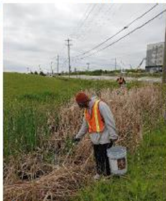
Perimeter Trash Pickup at VOA 5/6/2021