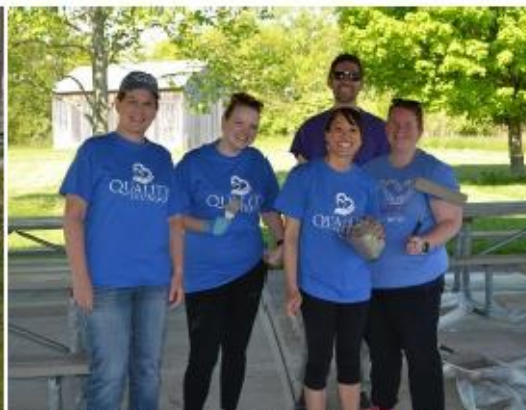
Quality Gold Service Day at Chrisholm Historic Farmstead 5/15/2021