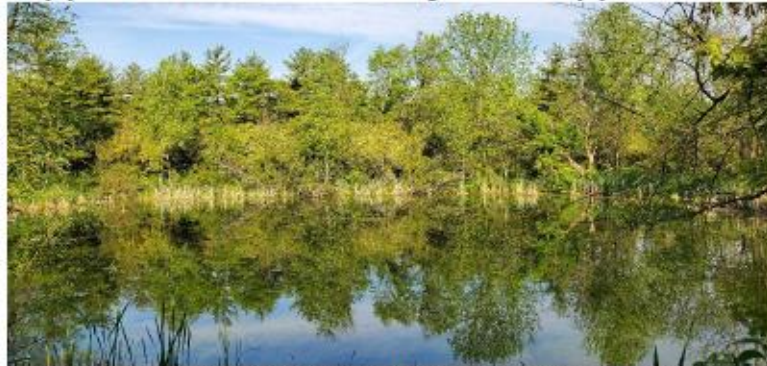
Pond Trail, Rentschler Forest MetroPark – Line Hill area.