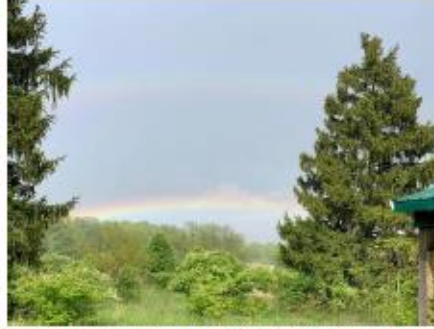
Double rainbow at Elk Creek MetroPark – Meadow Ridge area.