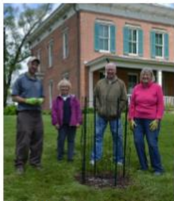
Chestnut Tree Planting at Chrisholm Historic Farmstead 5/5/2021