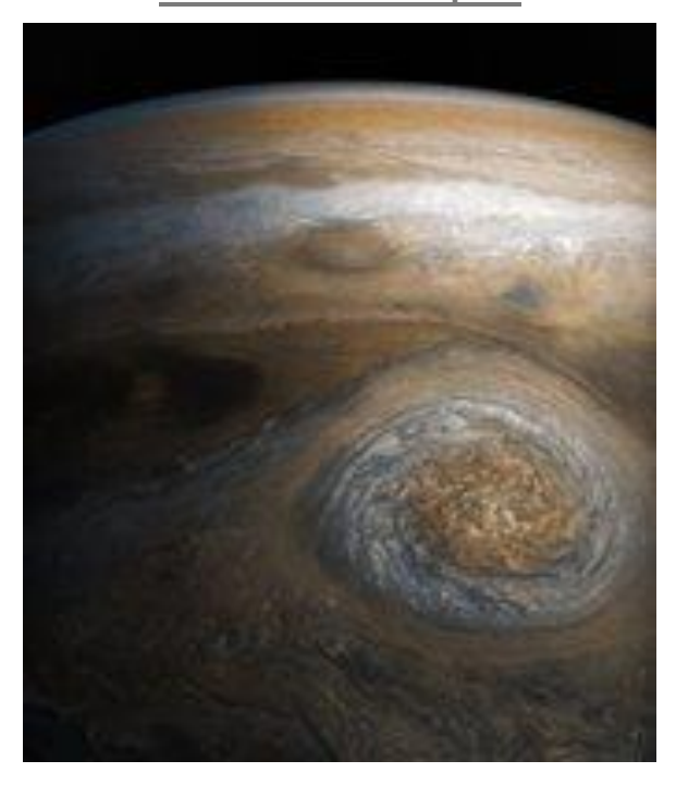
Meet the Planet: Jupiter

Join us with members of the Cincinnati Astronomical Society to learn all about our planets! The night will begin with fun crafts for the kids. After it gets dark, we will then view Jupiter and other amazing astronomical phenomenons with some extraordinary telescopes. Bring a blanket or chair and enjoy a relaxing star gazing evening with the family. Come anytime during the program. Free! Registration required by 6/7/2019.