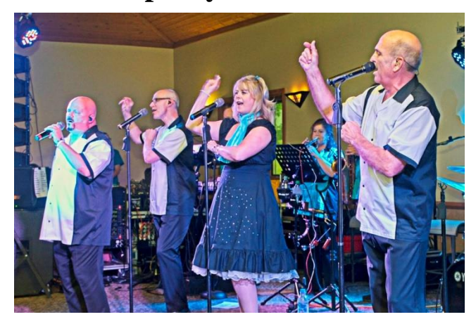
Hump Day 2 – The Belairs