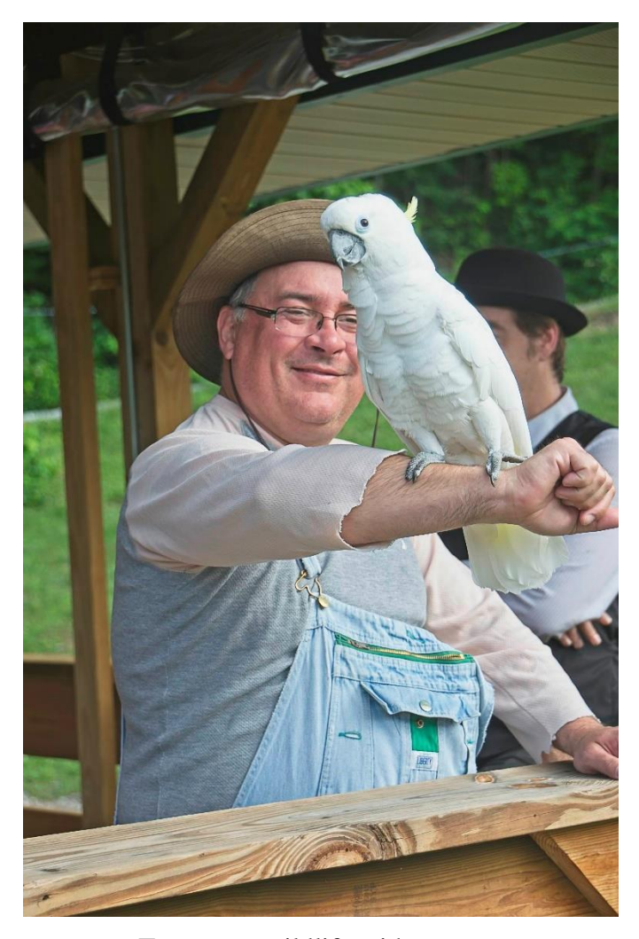
Tennessee wildlife with macaw.