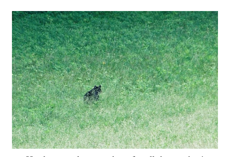
Hard to get close to a bear for all the tourists!