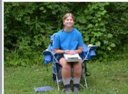
Long-term survey project at Rentschler Forest MetroPark-Reigart Road area