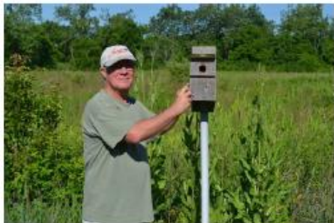
Nest box monitoring at Forest Run MetroPark-Wildlife Preserve Area