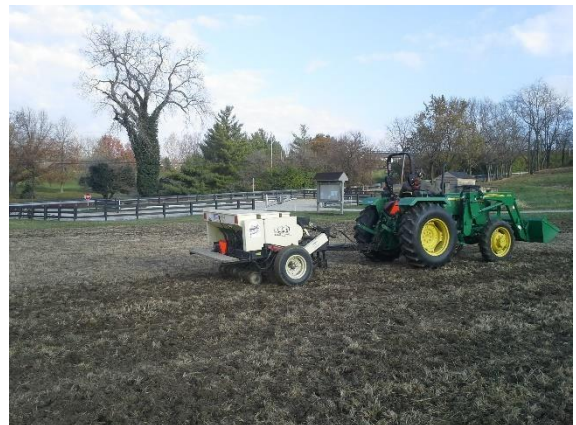
Figure 2. Seeding native prairie plants using seed drill

It is said that less than 1% of the 200 million acres of prairie grassland ecosystems in North America remain. In Ohio, the prairie ecosystem once covered about one million acres before pioneer settlement. Today, few prairies remain. Since 2015, MetroParks of Butler County has been constructing native prairie and grasslands on MetroPark properties in Butler County with the goal of creating diverse natural habitats and favorable conditions for wildlife and pollinator species. Prairies have been planted on former agriculture land at Forest Run MetroPark and Four-Mile Creek MetroPark and on former golf course land at Elk Creek MetroPark. MetroParks and our partners have created and are maintaining 79.5 acres of native grassland and 224.5 acres of prairie.