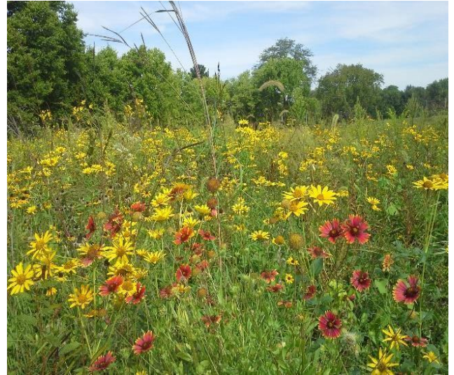
Figure 1. Prairie Plants at Forest Run MetroPark

It is said that less than 1% of the 200 million acres of prairie grassland ecosystems in North America remain. In Ohio, the prairie ecosystem once covered about one million acres before pioneer settlement. Today, few prairies remain. Since 2015, MetroParks of Butler County has been constructing native prairie and grasslands on MetroPark properties in Butler County with the goal of creating diverse natural habitats and favorable conditions for wildlife and pollinator species. Prairies have been planted on former agriculture land at Forest Run MetroPark and Four-Mile Creek MetroPark and on former golf course land at Elk Creek MetroPark. MetroParks and our partners have created and are maintaining 79.5 acres of native grassland and 224.5 acres of prairie.