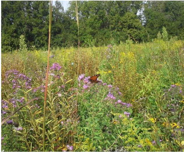
Figure 3. Monarch butterfly on aster in MetroPark prairie