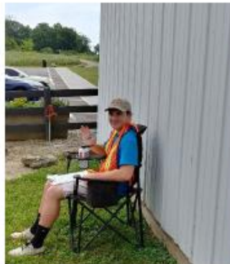
Long-term survey project at Forest Run MetroPark-Timberman Ridge area