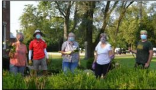
Friends of Chrisholm Board members doing some gardening at the Augspurger House - Chrisholm MetroPark