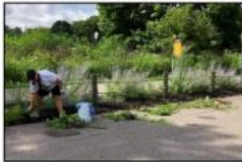
Trail Ambassador cleaning up the gardens on the Great Miami River Trail in Middletown