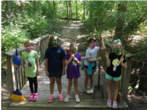
Local Girl Scouts cleaning off a footbridge at Forest Run MetroPark - Wildlife Preserve Area