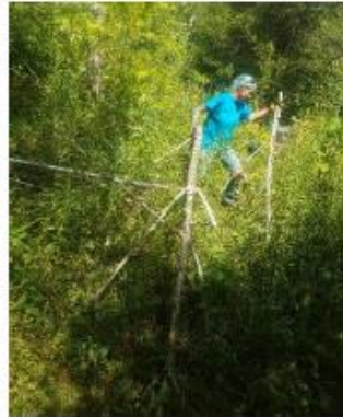
Equestrian Trail Maintenance Stewards clearing a horse trail at Elk Creek MetroPark - Sebald Park Area