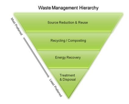
Figure 2. Waste Management Hierarchy with the least preferred method at the bottom (EPA,