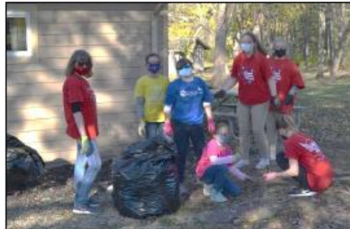
American Heritage Girls Service Day 11/7/2020 Rentschler Forest MetroPark – Timberhill area