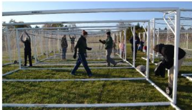
Service Day at Voice of America MetroPark-Athletic Complex 11/2/19