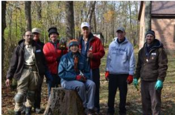
Service Day at Indian Creek MetroPark Pioneer Church Committee 11/2/19