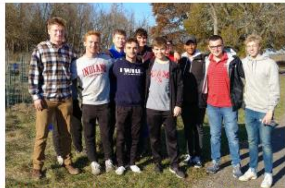
Tree Planting Elk Creek MetroPark Meadow Ridge area Beta Theta Pi 11/10/19