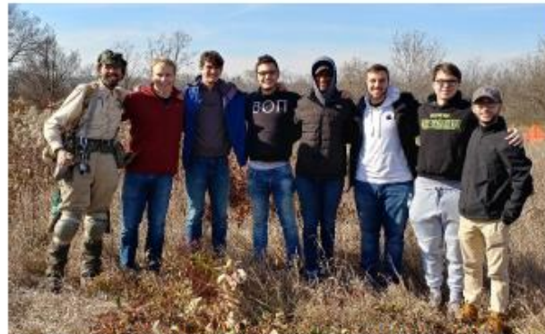
Service Day Forest Run MetroPark Timberman Ridge area Beta Theta Pi 11/17/19