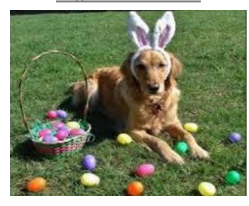
Dog-Gone Bone Hunt

Grab the leash and head out to Rentschler Forest (Reigart Rd. Entrance) on Sunday March 25<sup>th</sup> from 12:00-4:00pm for an egg hunt designed just for the dogs! Plastic eggs filled with dog treats will be Hidden over a well-defined area of the park. Find a