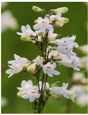
Little Birds All in a Row