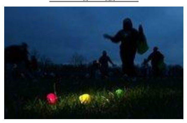
Flash Light Egg Hunt

Are you ready for a nighttime special delivery? Come out to FR Wildlife Preserve on Friday March 23 from 8:30-11:00pm but make sure to bring your Flashlight and join in the fun! Participants will hunt for one dozen eggs to be exchanged for Bags of goodies. Be on the look out for the GOLDEN EGG.