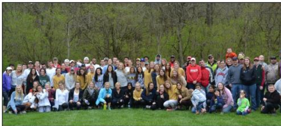
Greek Spring Clean group and Butler County 4-H members at the Earth Day Spring Cleanup day Elk Creek MetroPark-Sebald Park Area April 22, 2018