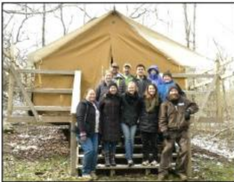
Spring platform tent installation Rentschler Forest MetroPark Timberhill Area April 7, 2018