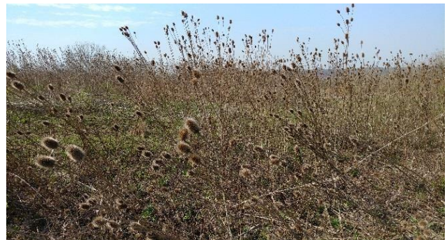
Photo 1. Teasel in winter forming monoculture

Spring is a good time to work on non-native invasive plants. One plant the Land Stewardship Unit at MetroParks targets this time of year is Teasel. Two types grow in the MetroParks, common teasel and cut-leaved teasel. Common Teasel has purple flowers and cut-leaved has white flowers. Teasel is a biennial that grows during its first season as a rosette and then in its second year produces a flowering stalk. It is highly competitive and will grow in dense patches. Each plant can produce up to 2,000 seeds and if left untreated can form dense monocultures that outcompete native plants (photo 1).