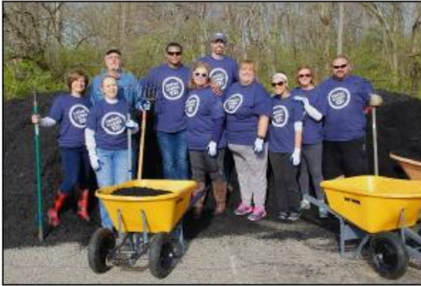
Community First Day of Caring at Forest Run MetroPark Wildlife Preserve Area April 21, 2018