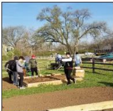
Keep Middletown Beautiful at the Community Gardens April 21, 2018