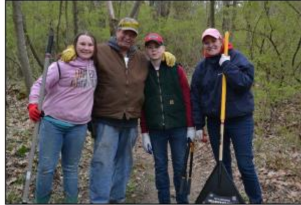
4-H Group at the Earth Day Spring Cleanup day at Elk Creek MetroPark-Sebald Park Area April 22, 2018

"As you grow older, you will discover that you have two hands — one for helping yourself, the other for helping others."