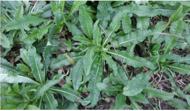
Photo 2. Teasel Rosette Patch

MetroParks uses a variety of techniques to control this plant. It is important to match the appropriate control method to the plants life stage and time of year.