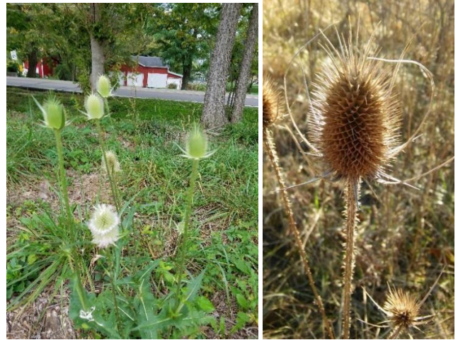
Photo 3 and 4. Teasel flower head

It is important not to ignore this plant in your yard or field. Teasel is so aggressive that it will displace the other plants growing in the same area. For questions or more information on invasive plants and plant control, contact the Land Stewardship Unit at MetroParks of Butler County.