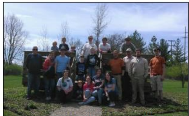
Day of service at Gilmore MetroPark-Gilmore Road Natural Area April 21, 2018