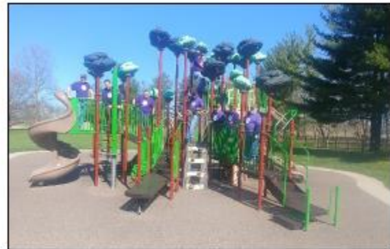
Mulch application by GE Aviation at Rentschler Forest MetroPark-Reigart Road Area April 20, 2018