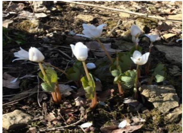
Bloodroot at Rentschler Forest MetroPark – Cascades Trail

Bloodroot, a part of the Poppy Family, has a single white flower that grows up through the middle of the leaf (Niering, 1979). The plant produces a red juice from the roots which was used for dyeing clothes and baskets by the Native Americans (Henn, 1998).