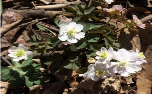
Rue Anemone at Rentschler Forest MetroPark – Cascades Trail

Rue Anemone, in the Buttercup Family, is a perennial that loves forests and woodland habitats (Henn, 1998). This plant, often mistaken for wood anemone, is made up of three lobed compound leaves with about 2 to 3 flowers per stalk (Niering, 1979; Henn, 1998). Be sure to get out and see this flower soon as it's blooming period is coming to an end.