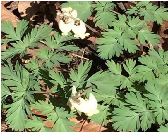
Dutchman's Breeches at Rentschler Forest MetroPark – Cascades Trail

There are many other wildflowers to watch out for that are currently in bloom including Dutchman's Breeches, Cut-leafed Toothwort, Spring Beauty, Toad Shade (Sessile Trillium), Violets and many more. Be aware of those tricky invasive species that might look beautiful but are harmful to our local biodiversity including Lesser Celandine, Garlic Mustard, Amur Honeysuckle, Periwinkle and more.