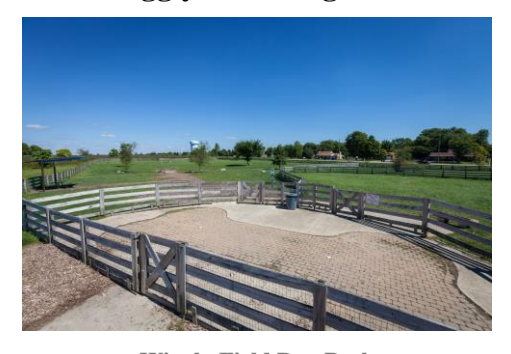
Wiggly Field Dog Park

Wiggly Field is a fenced-in dog park that is located near the Athletic Field Complex with in Voice of America MetroPark.