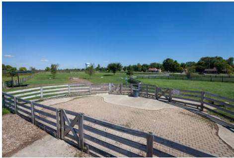
Wiggly Field Dog Park

Wiggly Field is a fenced-in dog park that is located near the Athletic Field Complex with in Voice of America MetroPark.