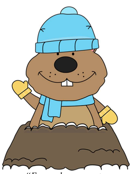
"Everywhere, creatures Are falling asleep..." Dr. Seuss, The Sleep Book

How do animals make it through an Ohio winter? Do they hibernate? Woodchucks (AKA groundhogs or whistle pigs) do! Woodchucks are one of the few animals in Ohio that go into true hibernation. They can drop their body temperature from a normal 99 degrees to 37 degrees in hibernation! Compare that to humans. We go into mild hypothermia at a loss of a mere 3 degrees and lose consciousness at 82 degrees. Quite different from woodchucks.