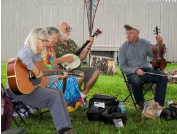
The Jump 'n Jive Show Band Hump Day Concert