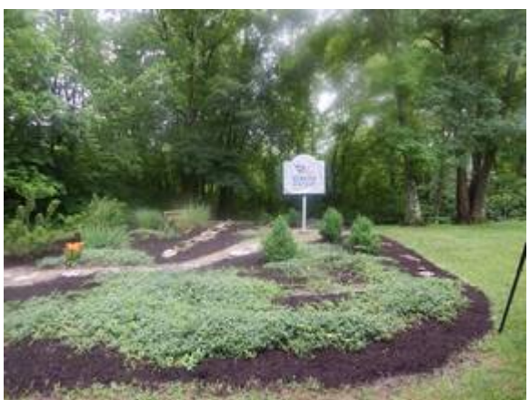
Well done, MetroParks Staff