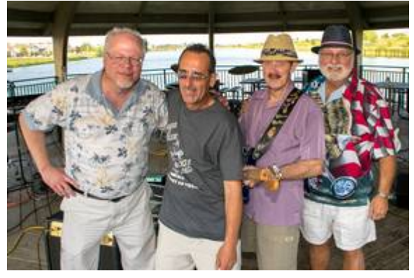
The Sweet Beats – Beatle Tribute Show Hump Day Concert