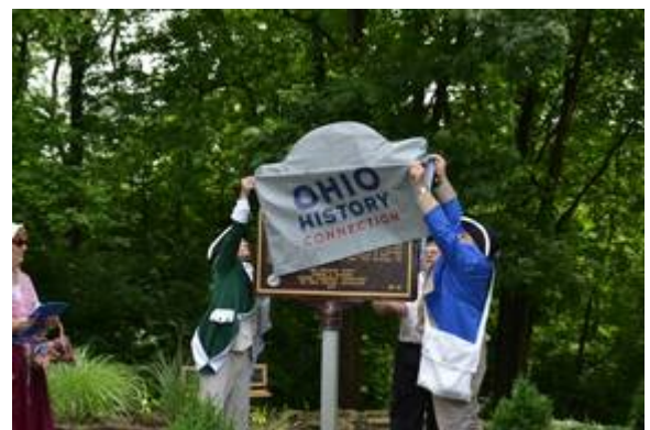
Members of the SAR, Cincinnati Chapter unveil the marker.