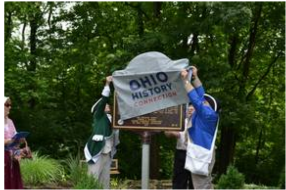
Members of the SAR, Cincinnati Chapter unveil the marker.