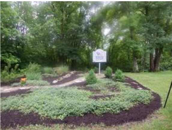
Well done, MetroParks Staff