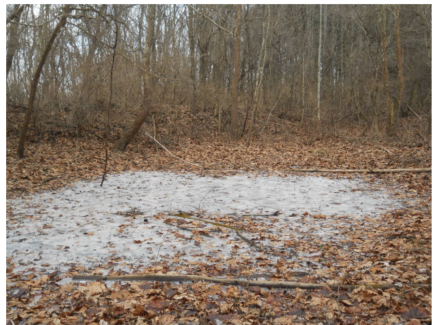
One of several vernal ponds located at Upper Indian Creek MetroPark

Another extremely interesting creature, albeit it is one I haven't seen in a while, is the Spotted Salamander. We have them here in SW Ohio and soon they will be migrating. Migrating? I was completely unaware of this phenomenon until someone recently described it to me. Apparently, in the spring, when the temperature begins to rise these small amphibians make a rapid migration towards their annual breeding ponds, aka vernal ponds. Sometimes in just one night, hundreds of the salamanders make the trip to their pond for mating.