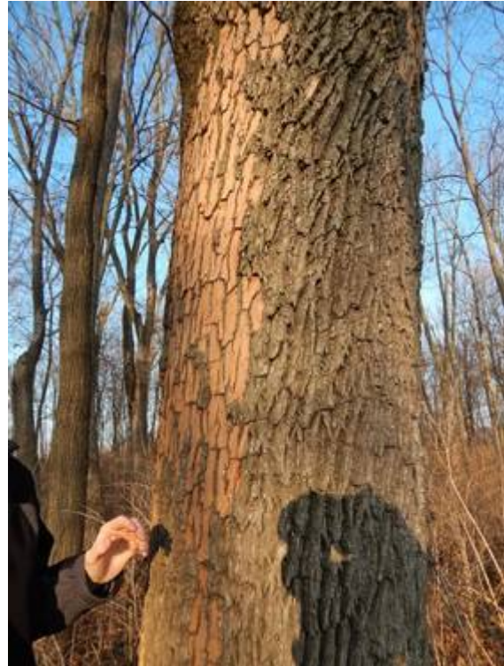
Bark Scaling on large ash tree from Emerald Ash Borer infestation. Too late for the tree, lost, but good food source for the local woodpeckers.

Practical in the field application of the techniques that were learned