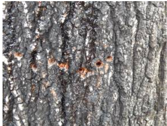
Sugar maple tree with neat row of drilled holes by a yellow-bellied sapsucker, sap from tree was dripping and tasted very sweet!