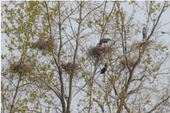
Great blue heron, great egret, & double-crested cormorants

Seven days of intense birding in early May led an intrepid group of hardy individuals to ten MetroParks and several other unique birding hotspots inside the boundaries of Butler County. Big birds seen included nesting eagles, osprey, great egret, great blue heron and double-crested cormorants. What a treat to locate these birds all nesting in Butler County.