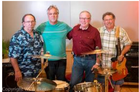
Thunder Bay Band