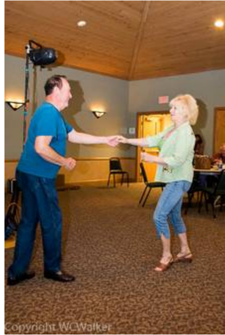
Cutting the Rug