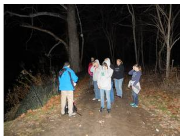
Thanks for Giving, A Night of Volunteer Appreciation