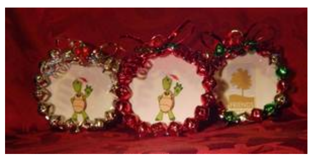
Desktop ornaments (Red, Silver or multicolor) are also available for $6.00 each. Your choice of logo.

Other similar styles (bell or wreath) are available with your choice of either the turtle logo or Friends logo. Ornaments may be purchased for the nominal cost of $5.00 each. One hundred percent of the proceeds will be returned to FOMPBC.