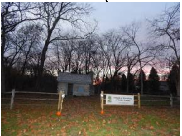
Dudley Woods Cabin/Campfire