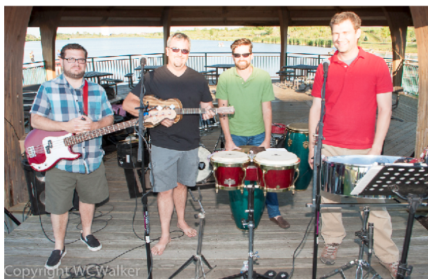
The Queen City Silver Stars