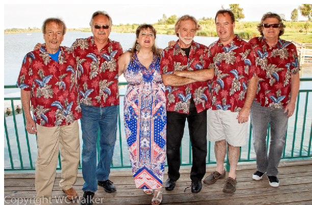
The Saffire Express