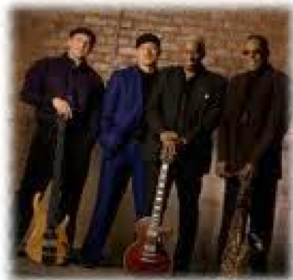
August 13th: The Medicine Men

It's Hump Day! Celebrate the middle of the week with a free evening concert at the beautiful VOA lake. Bring your lawn chairs, blankets, and friends every other Wednesday throughout the summer for a variety of bands. Food and beverages are available for purchase. See you at the Gazebo at 7850 VOA Park Dr., West Chester OH 45069. 7 to 9 PM.