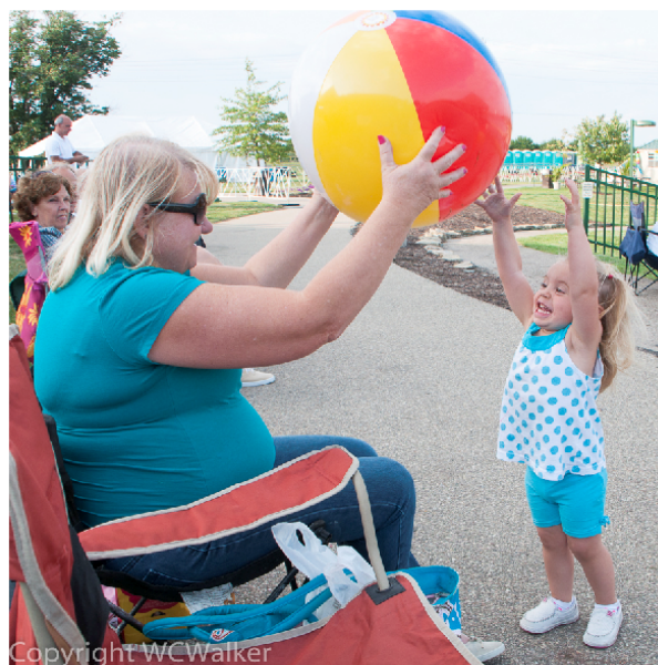
Beachballs toured the crowd during the Saffire Express concert

Plan to join us during the remaining two Hump Day Concerts in August.