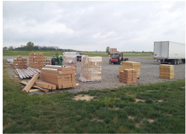
New Soccer Goals arrive for VOA Fields

August 23, 24, 30 and 31. First light of dawn. Gilmore Ponds, Hamilton; Clear lanes and nets and assist experienced bird-banders –no experience necessary- wonderful opportunity to see birds up close and capture important data.