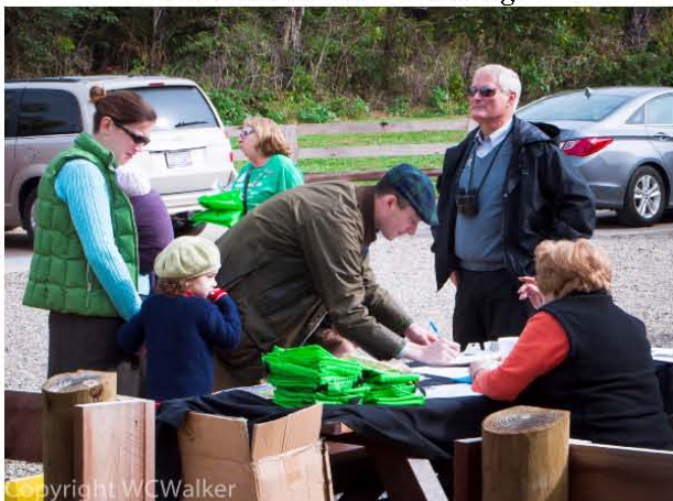
The Viewers from the Ridge