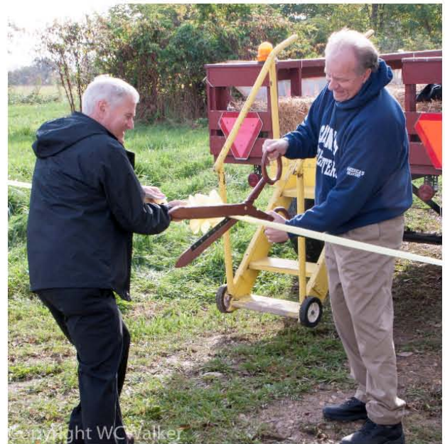
Cutting the Ribbon