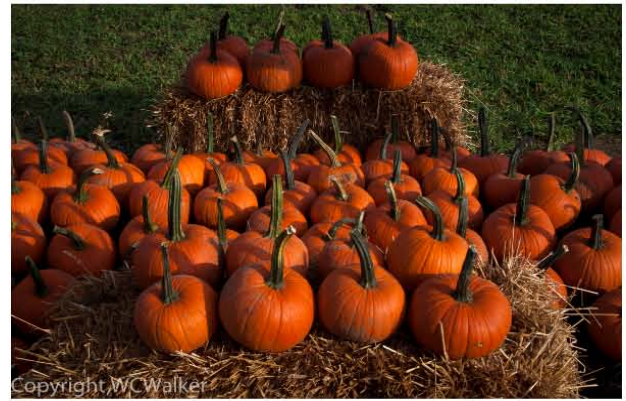
Pies in Training