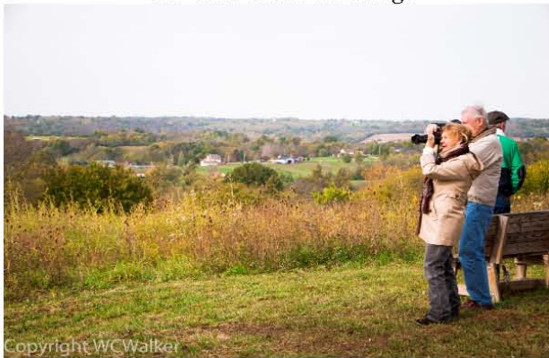
The View from the Ridge