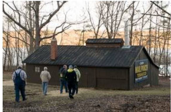
The sugar shack at Heuston Woods