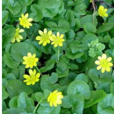
Lesser celandine April 11, 2006

Lesser celandine has been introduced to gardens in the United States several times. The plant is found across Europe and Asia. It thrives in wetlands, and is uncommon on higher, drier sites.