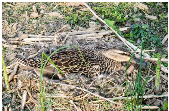
Probably not neotropical