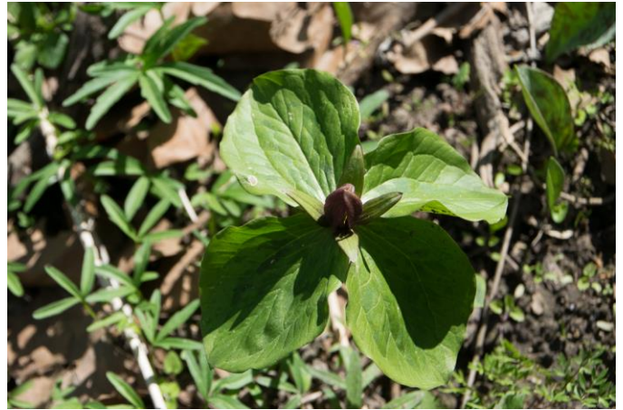
A rare 4-leafed sessile trillium