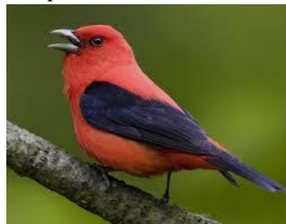
Male Scarlet Tanager

How far do they travel? Migrating birds travel distances range from a few hundred miles to over 10,000 miles! The shortest migrations are made by birds that breed in the southern United States and winter in Mexico or the West Indies. Some of the longest migrations are made by shorebirds that nest in the arctic tundra of northernmost Canada and winter as far south as Tierra del Fuego (the southernmost part of South America), a one-way distance of up to 10,000 miles.