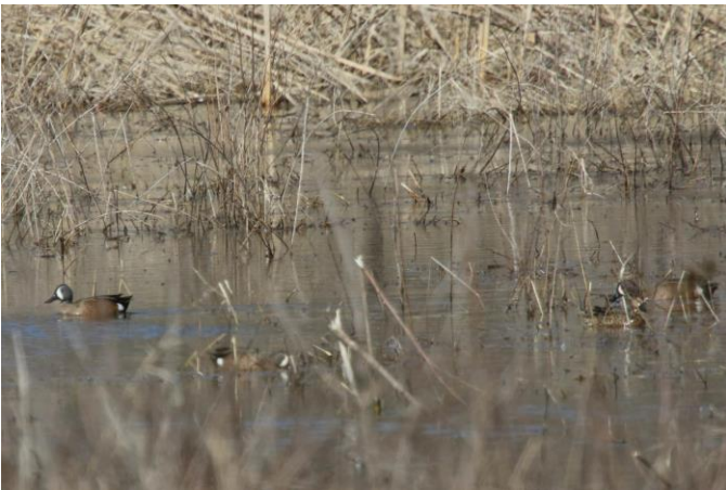
Blue Wing Teal