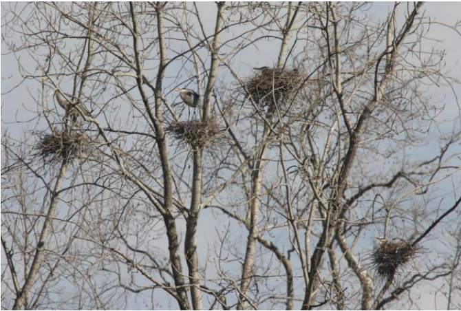
Blue Heron Rookery at Gilmore Ponds