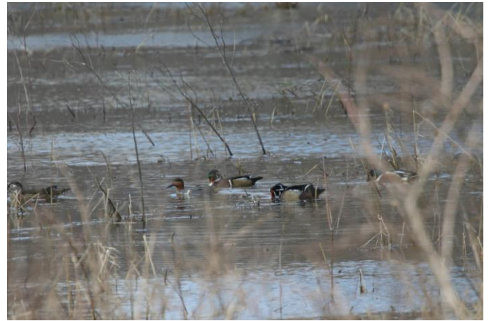
Green Wing Teal