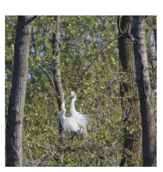
Photographers Needed by Cristy Trammell