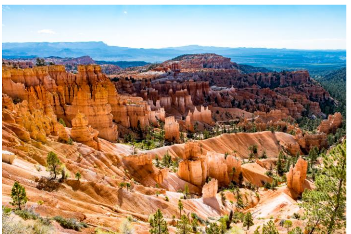
Editor just back from Bryce National Park – special feature next month

If any of these future opportunities sound interesting to you, please email Zach Marcum at <u>zmarcum@yourmetroparks.net</u> for more information.