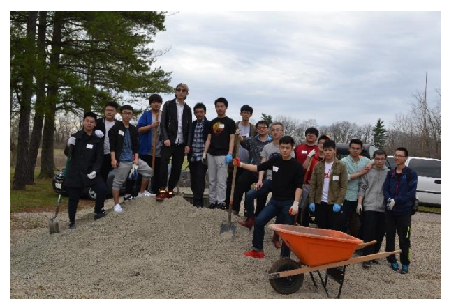
Great Miami River Recreation Trail Ambassador Training

What: Stepping Forward: Service Days allow for volunteers to do a number of activities at various parks throughout the year. Service Days are held to keep parks clean, improve habitat, complete projects, and prepare for events. MetroParks is partnering with the Hamilton Parks Conservancy to improve trail conditions at Miami Woods. Join MetroParks and the Parks Conservancy in a Service Day to make trail improvements. Volunteers will primarily be removing invasive species along the trails.