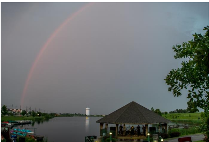
A rainbow applauds a concert in the rain.