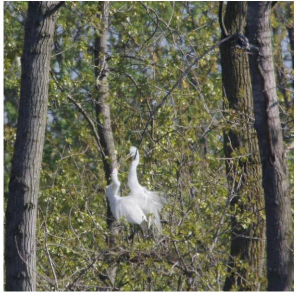
Photographers Needed by Cristy Trammell

The nests are easy to see from the observation platform overlooking the cattail marsh. Enjoy this rookery of mixed bird species because it is very special in Butler County, Ohio.