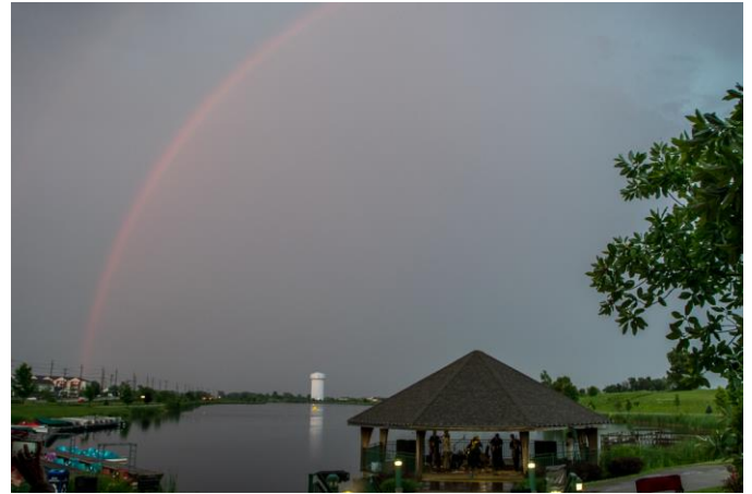
A rainbow applauds a concert in the rain.