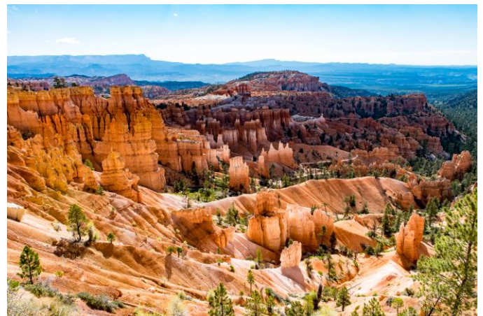
Editor just back from Bryce National Park – special feature next month

If any of these future opportunities sound interesting to you, please email Zach Marcum at zmarcum@yourmetroparks.net for more information.