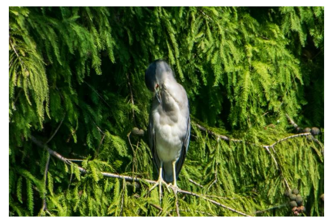
Adult Night Heron