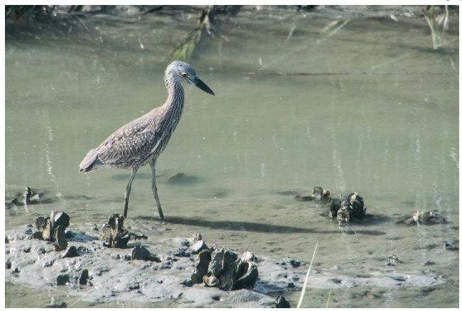
Juvenile Black-Crowned Night Heron