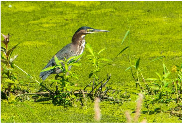
Female Green Heron

To those of you who notice the absence of a photo of the Cooper's hawk, let's just say that he was faster than I was!