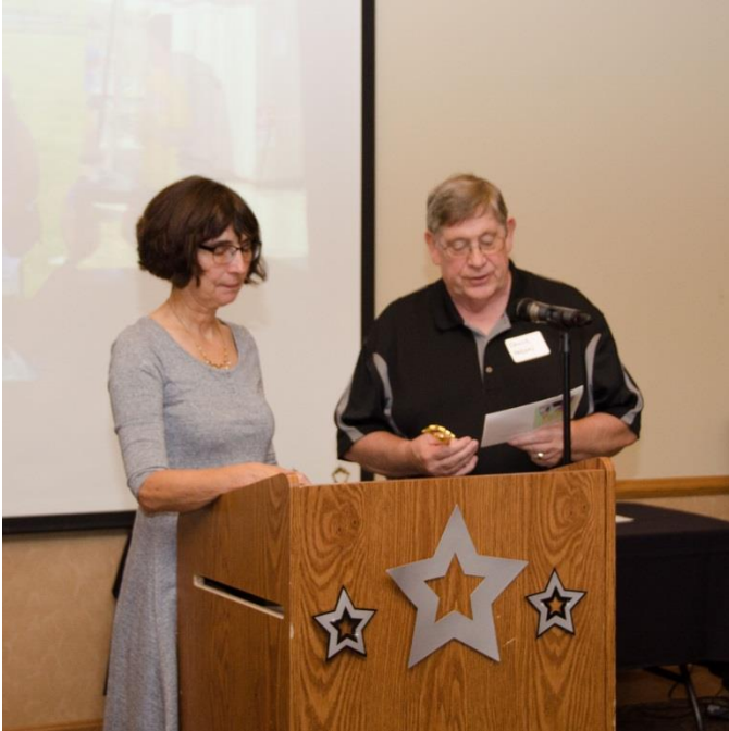
I finally got Bill's last word in! (Wanna bet, Chuck?)