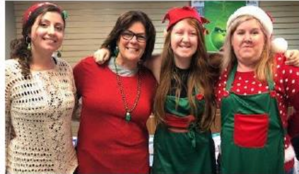
Breakfast with Santa volunteers December 16, 2018