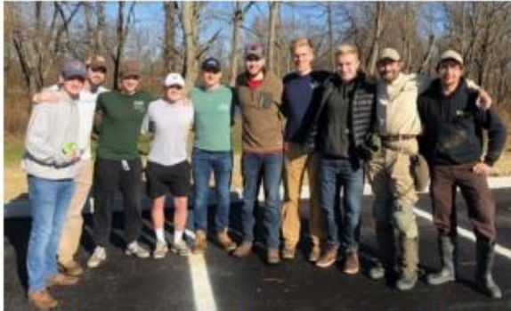
Chi Psi Fraternity assisting with honeysuckle removal 12/2/18