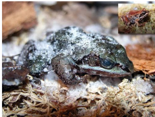
Wood Frog Rana sylvatica