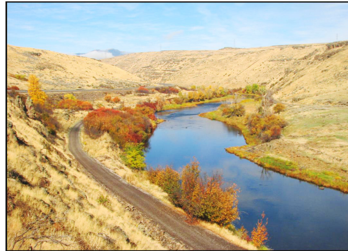
Beautiful vistas like this one in the Canyon south of Cambridge await those who travel the Weiser River Trail.

Mesa Siding (MP 56.5-- el. 2946) has parking just off Highway 95 near mile marker 132. The Trail parallels Highway 95 to Council.