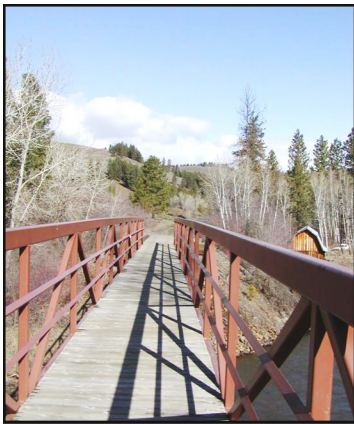
The Combs Trestle near Fruitvale offers a scenic crossing of the Weiser River.

The Weiser River Trail is Idaho's longest rail-trail and one of approximately 1800 rail-banked trails in the United States. It stretches 85 miles from Weiser to West Pine Road, 4 miles south of New Meadows. The Trail offers a variety of experiences for hikers, bicyclists, equestrians, cross-country skiers and other outdoor enthusiasts. The Trail surface has been smoothed and compacted, and is