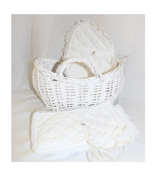
Small up to 16 Weeks