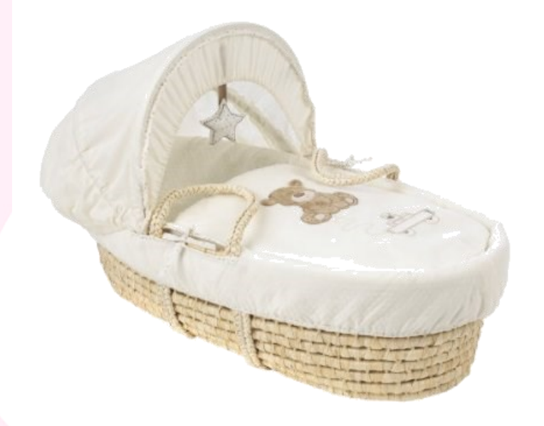
Large 24+ Weeks

Replacement covers for the small and medium baskets can be supplied upon request.