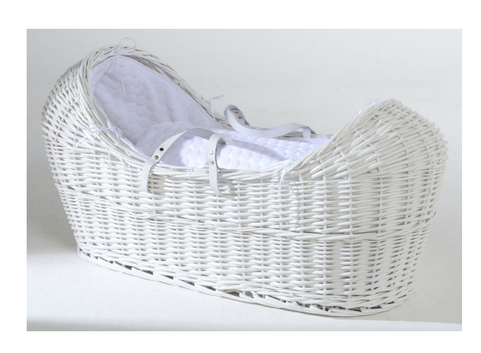
Medium Pod 16-24 Weeks