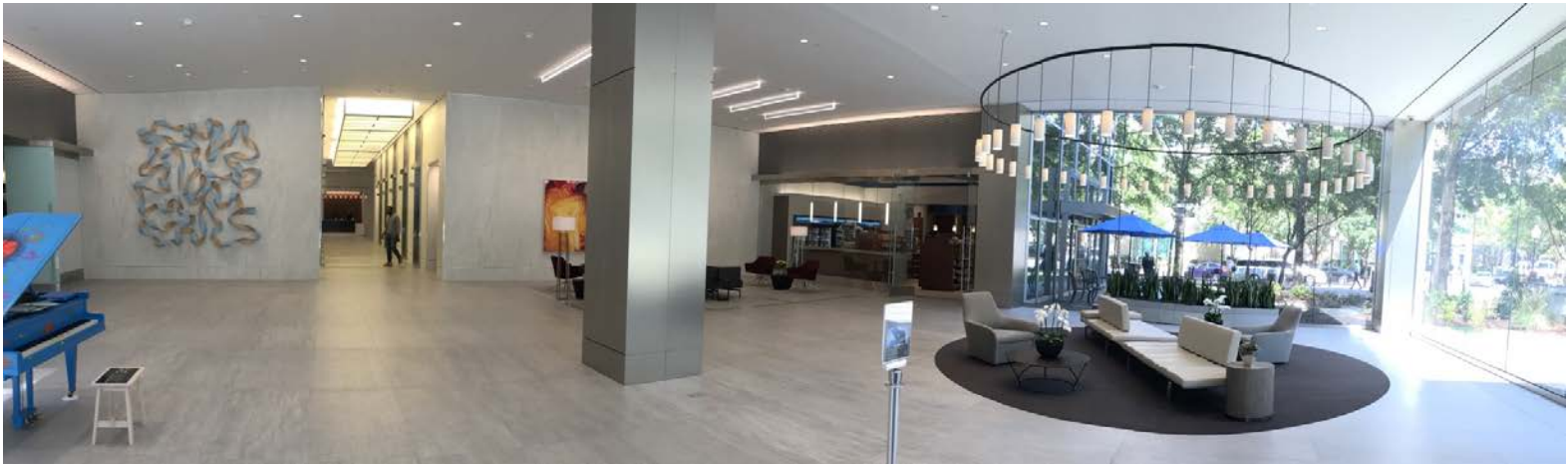
3340 Peachtree Road, Suite 2015 - Atlanta, Georgia 30326 - Tower Place 100