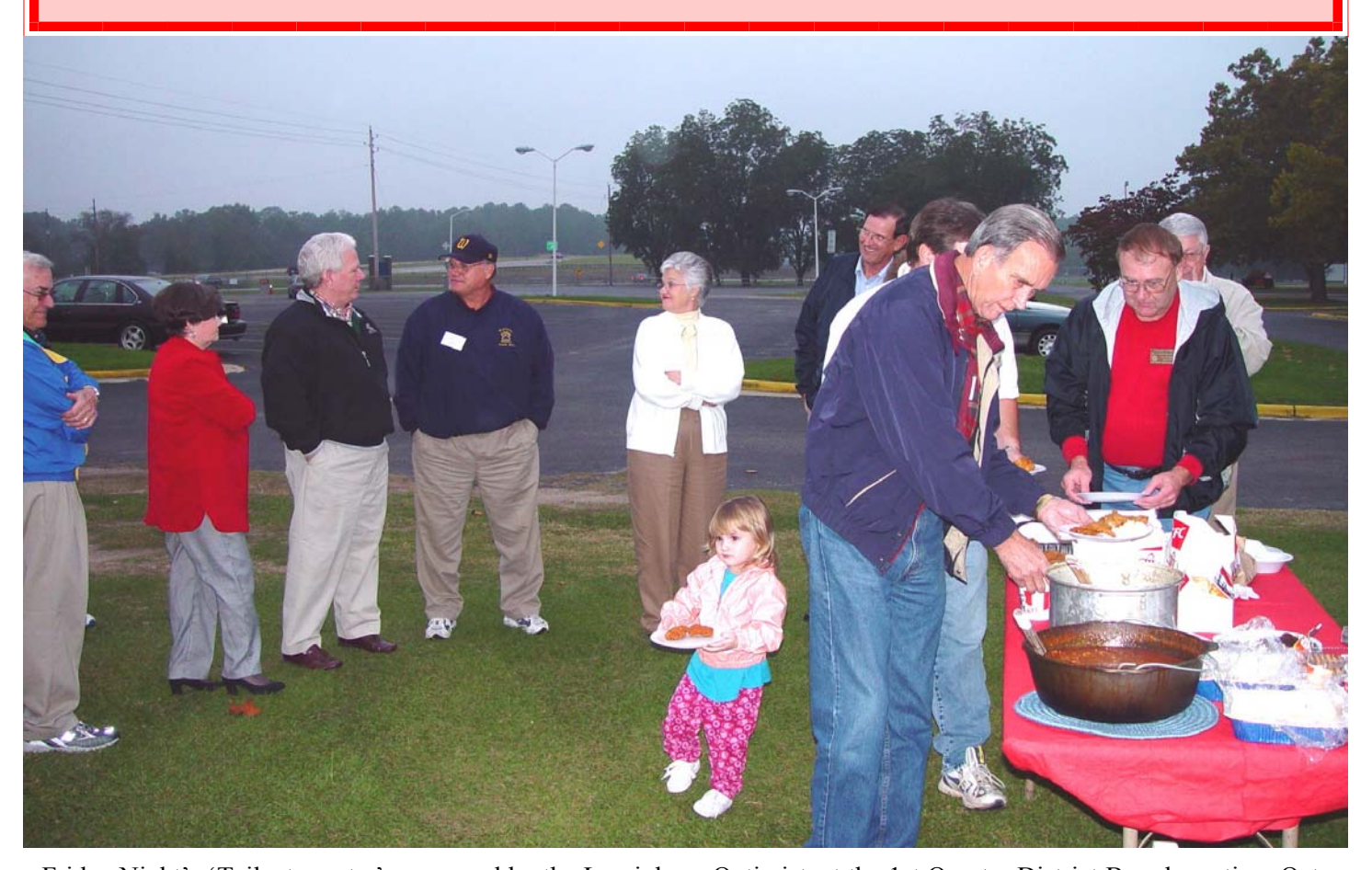
Friday Night's 'Tailgate party,' sponsored by the Laurinburg Optimist, at the 1st Quarter District Board meeting, October 25-26. Clouds were threatening, but rain was delayed until the party was over/