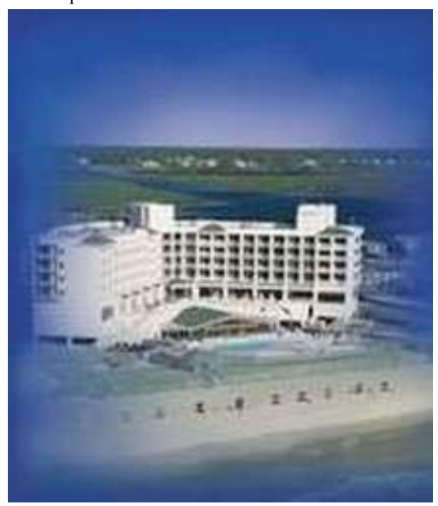
An oceanfront view of the Sunspree with spacious rooms facing either the ocean or the sound.