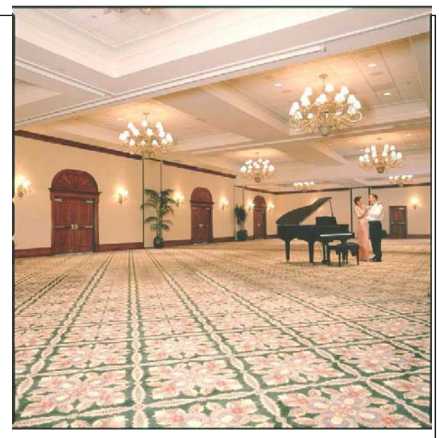
The Grand Ballroom where the Governor's Banquet and Ball will be held.