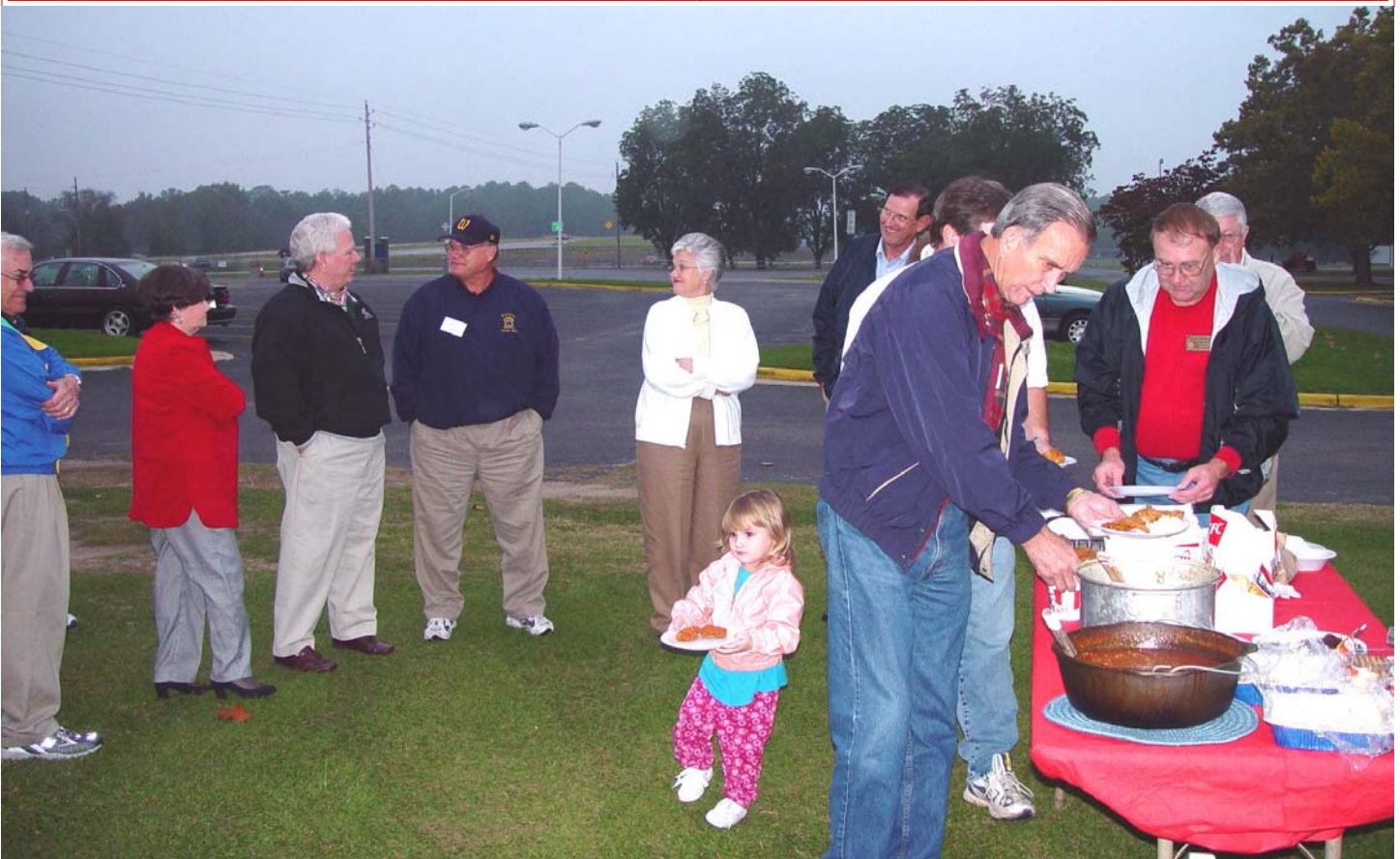
Friday Night's 'Tailgate party,' sponsored by the Laurinburg Optimist, at the 1st Quarter District Board meeting, October 25-26. Clouds were threatening, but rain was delayed until the party was over/