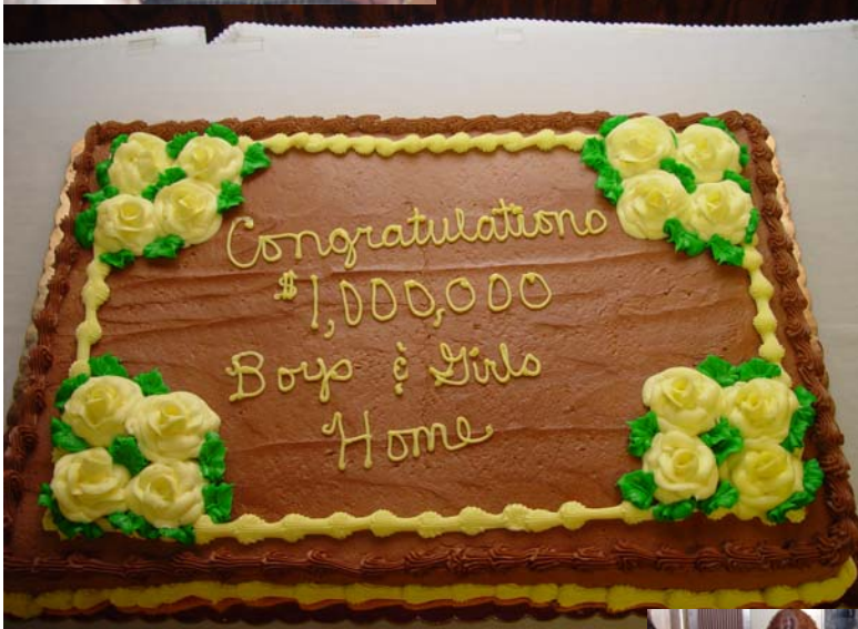
Commemorating the $1,000,000 endowment.

Two of the boys perform for the group by singing a song they wrote.. No stage fright here.