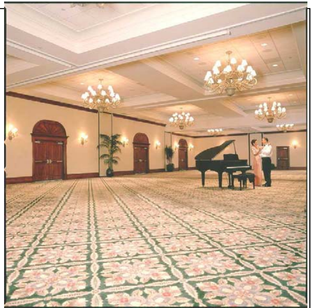
The Grand Ballroom where the Governor's Banquet and Ball will be held.