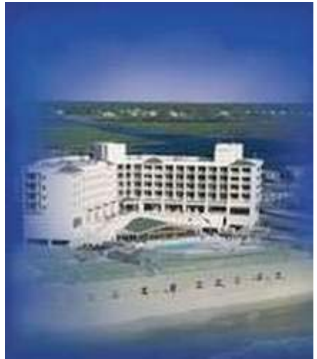
An oceanfront view of the Sunspree with spacious rooms facing either the ocean or the sound.