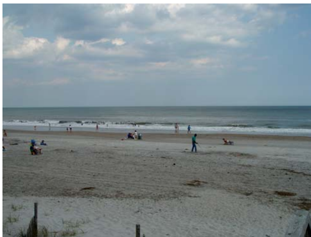
The ocean as viewed from the Sunspree boardwalk.