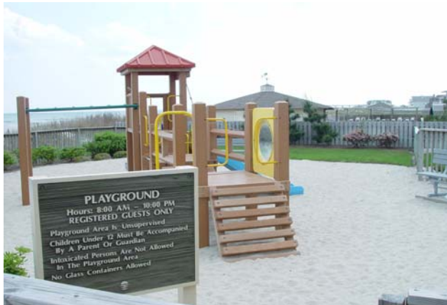
Playground for the under 5 crowd.