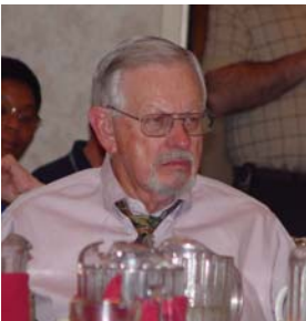
This picture has no significance, he just looks like a good example of a person in deep serious thought.

“There must be more than one way out of the doghouse”