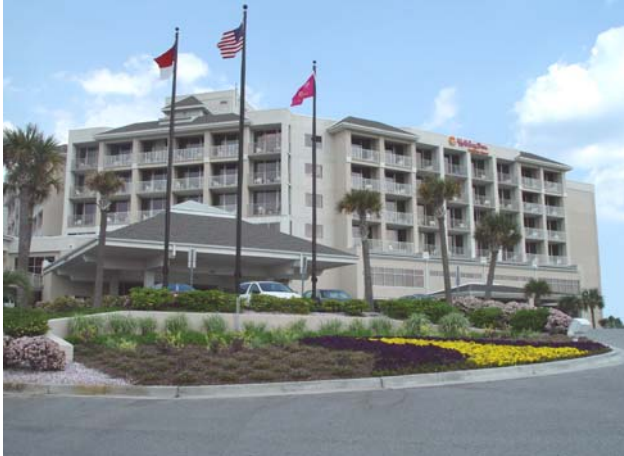
Front entrance to the Sunspree