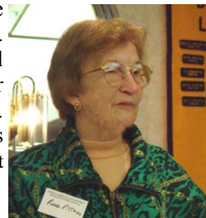
Rosa Pittman Oratorical Chair

announced at the Oratorical Luncheon. Each boy and girl winner will deliver their speech. Trophies and awards will be presented at that time.