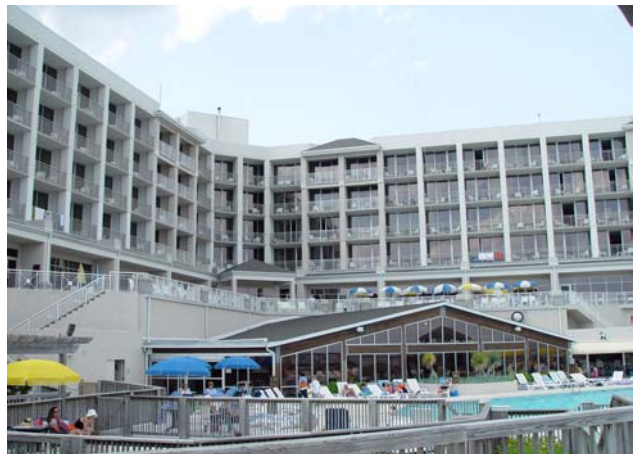
View from the walking deck overlooking the pool and the ocean front side of the hotel.