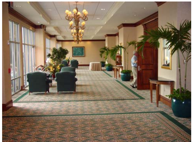
One of the spacious lobbies adjoining the meeting rooms.