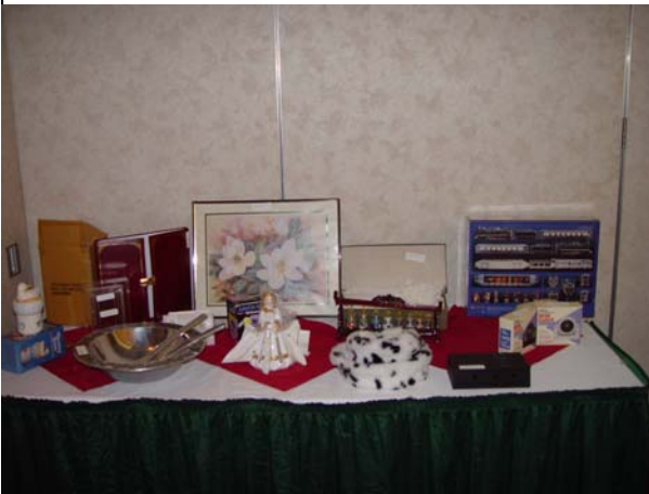
Some auction items displayed prior to the sale.

The OI Foundation auction held at the 2nd Board meeting in Greenville netted in excess of $1200. Many thanks to all the members and clubs that furnished items for the auction.