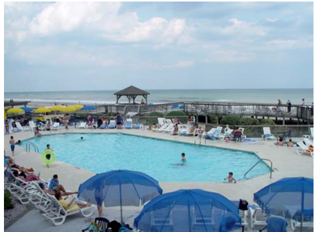
View from the verandah looking over the large swimming pool to the ocean.