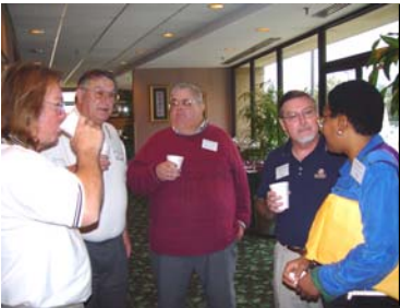
The Goldsboro group. Probably discussing how they are going to wrangle an invitation to the Wilson Evening Shrimp-a-roo