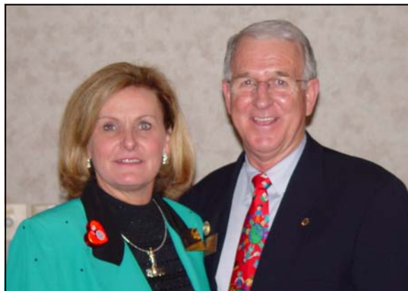
Our Governor and OI President pose for an official photo at the Greenville board meeting.

Don't forget spring is the best time for these award winning programs. Respect for Law, Youth Appreciation Week and Safety of Wheels.