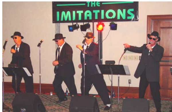
The Imitations, who entertained for three hours Saturday night, perform their rendition of the Blues Bros.