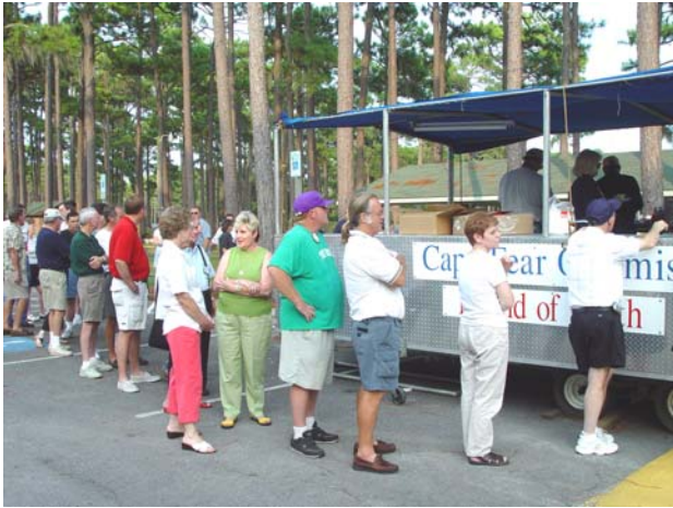
The Cape Fear Optimist brought their mobile concession stand and spent the evening serving hot dogs, hamburgers and various other sundries.