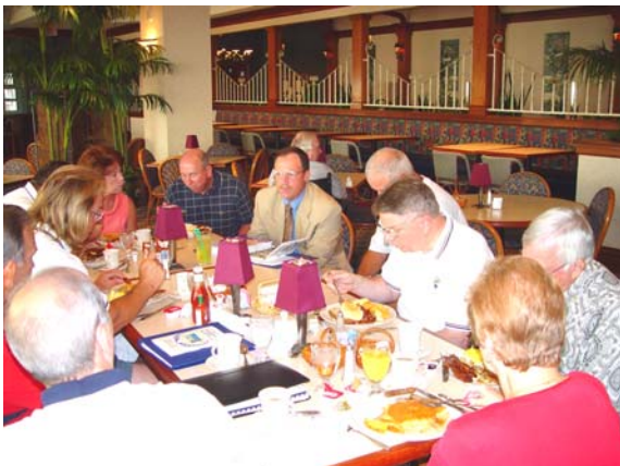
Training faculty meeting.

Third Quarter Conference: Holiday Inn; Rocky Mount, N.C.