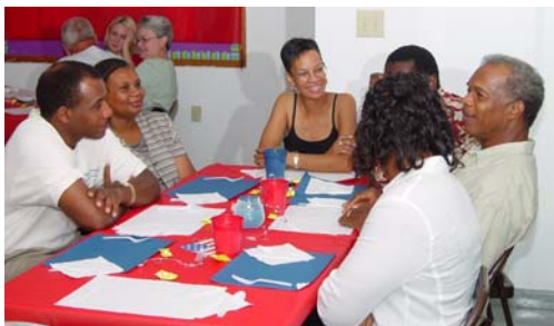
The Wilmington Inner City club crowd.

I plan to do a cook book as an OI Foundation fund raiser and would like to get a start on typing the recipes. The form is easy to follow and I would like to get at least one or two recipes in each category from each club. So the book would have 300-350 items. There will also be pages explaining the Foundation, Optimist international, the District and a list of the clubs in the District.