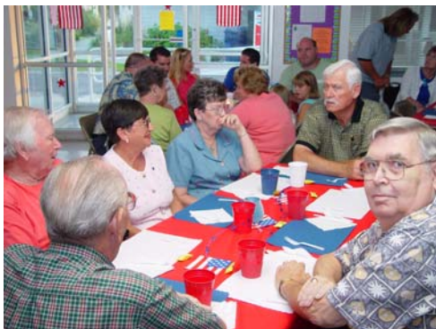
The Wilmington crowd.