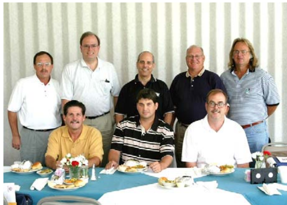
Lt. Governors training class.