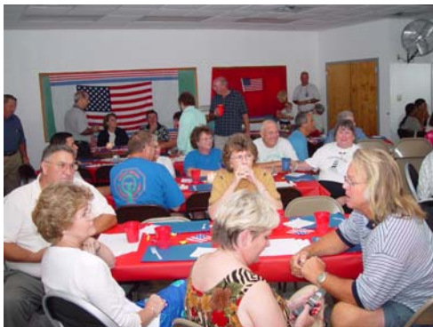
The Goldsboro crowd.