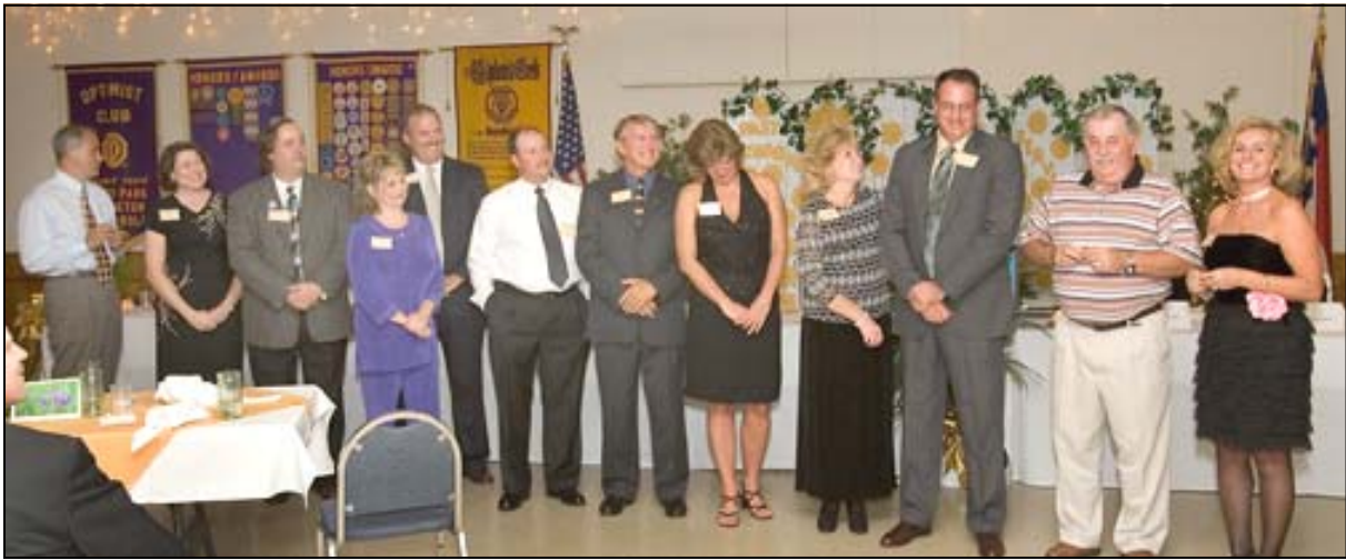
Wilmington Winter Park