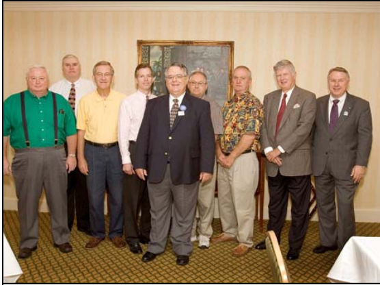
Rocky Mount Breakfast