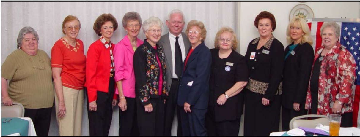
Wilson Golden Circle