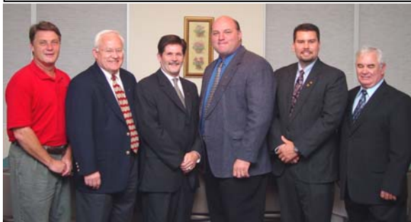
Wilson Evening Optimist Installation