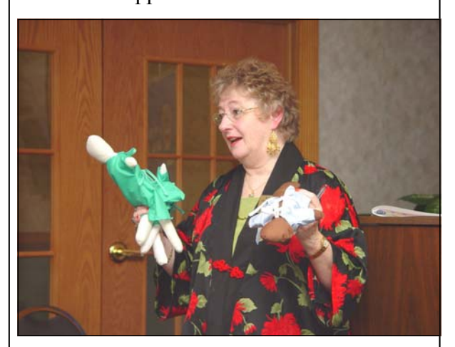
Thanks for all you do. Trish

Provide support to healthcare providers. Provide support for cancer research.