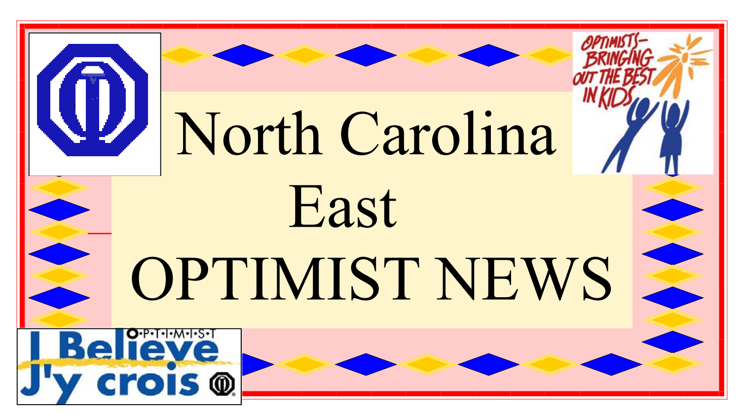
Vol. 4 Issue 4, August, 2006