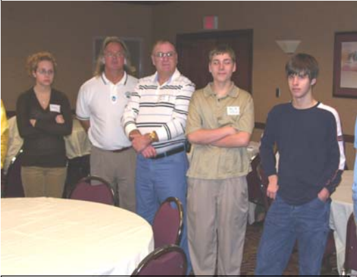
From the JOOI District Board meeting in Goldsboro in January

There were activities at the meeting to help members from different clubs get to meet and know members from other clubs. Door prizes were