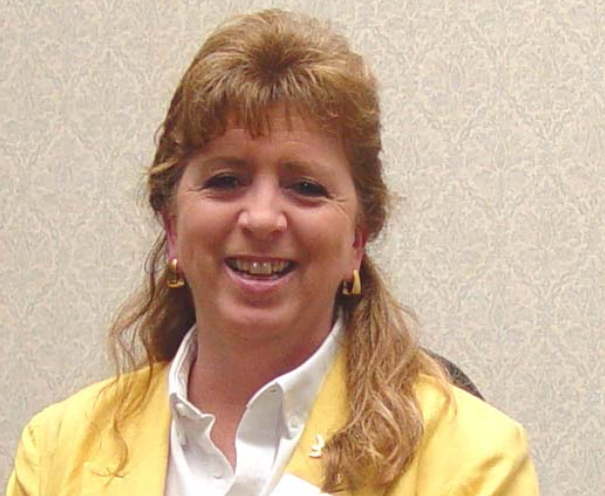
ATTENTION N.C. EAST DISTRICT CLUB FOUNDATION REPRESENTATIVES (CFR'S). THERE WILL BE A TRAIN-ING DURING THE 1ST QUARTER DIS-TRICT MEETING. PLEASE TRY TO AT-TEND. ALL THOSE THAT ATTEND WILL HAVE THEIR NAME PLACED IN A RAFFLE FOR A SUPER GIFT! HOPE TO SEE YOU THERE...

Your "Growth Team" which consist of your District Officers, Lt Governors and District Chair's, started this year with a successful "District Administrative Conference" and will be passing the wealth of information on to your clubs during your Zone meetings and one-on-one's. We are here to provide information and help to you so please call on each of us!