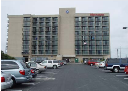
Sheraton Hotel Atlantic Beach