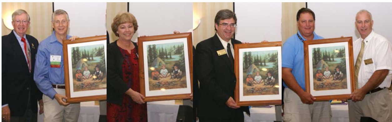
Four clubs receiving OI Foundation Picture for donation levels.

Thank you for your hard work and donations to support the Optimist International Foundation.