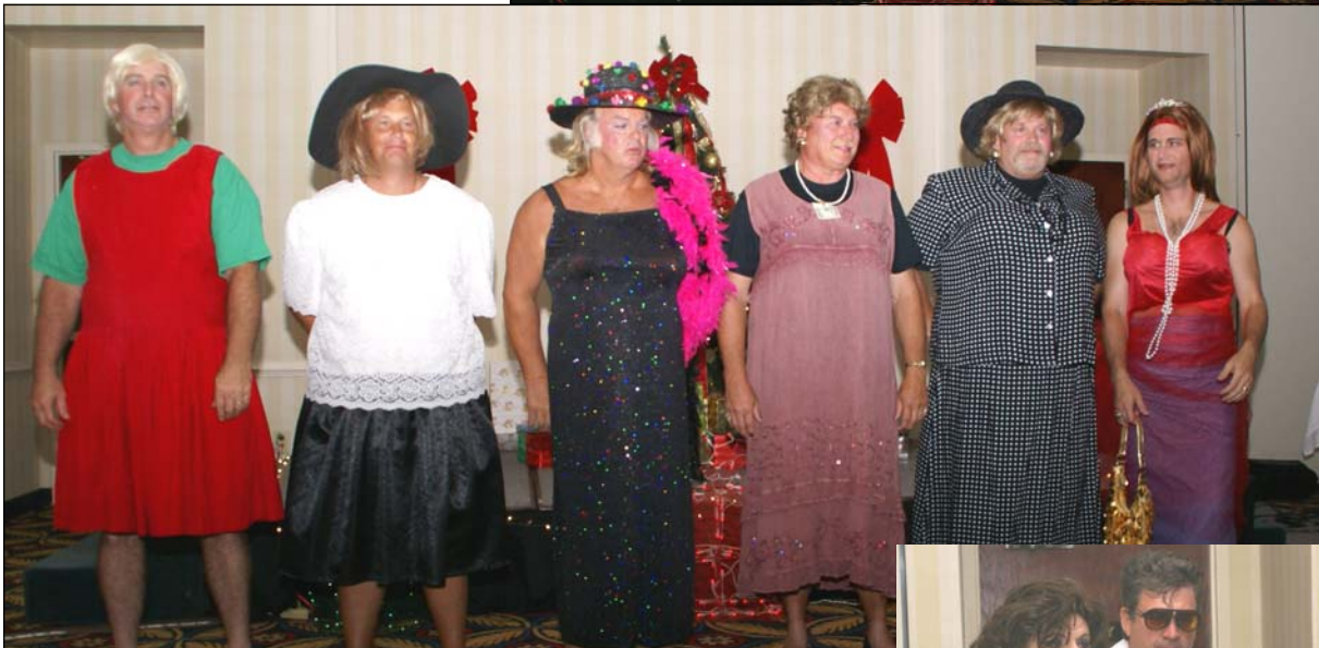
The Womanless Beauty Pageant held Friday night, as a benefit for the Boys & Girls Home at Lake Waccamaw, featured six ladies , along with Patsy Cline and Elvis Presley. All contestants will remain anonymous.