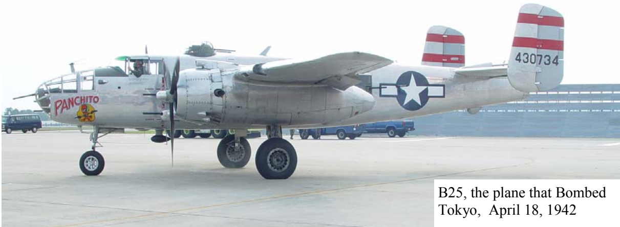
B25, the plane that Bombed Tokyo, April 18, 1942

Cape Fear Optimist hosted a Texas Hold'em Poker Tournament to benefit the Boys & Girls Homes of North Carolina on Saturday, January 17, 2009