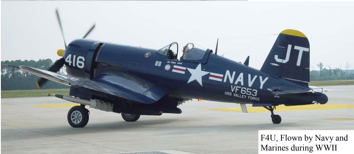
F4U, Flown by Navy and Marines during WWII