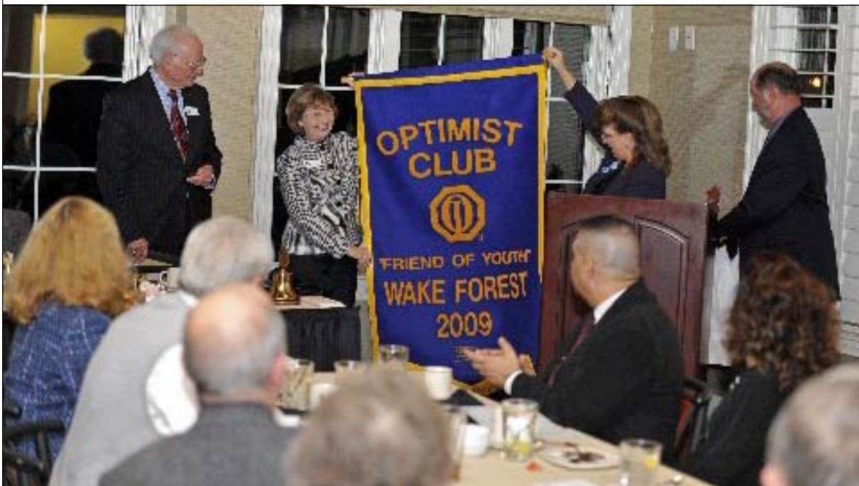
Installation night at the new Wake Forest Optimist Club