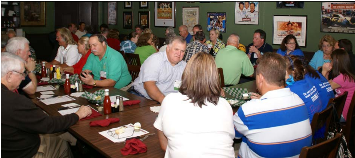
Friday night meal at 1st Quarter Board Meeting in Laurinburg.