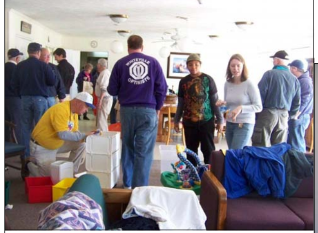
called this the 100 Optimist Work Day hoping to have that many to show up and work. What a great turn out we had with 16