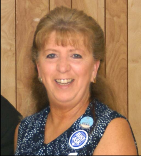
(Continued on page 16)

Last year in beautiful North Myrtle Beach at our district convention, Governor Auston asked those in training about their commitment to build new clubs in communities which have no Optimist Clubs. Each gave names of communities within their respective zone which would be a great possibility for a new club. Those possibilities are: Zone 1 - Wilmington and Topsail; Zone 2 - Hope Mills and Pembroke; Zone 3 - Kinston and New Bern; Zone 4 - Nashville; Zone 5 - Scotland Neck; Zone 6 - Fuquay-Varina and Durham. The great news is that we now have new clubs in Wilmington and Wallace and the growth team members are working on clubs in Fuquay-Varina and New