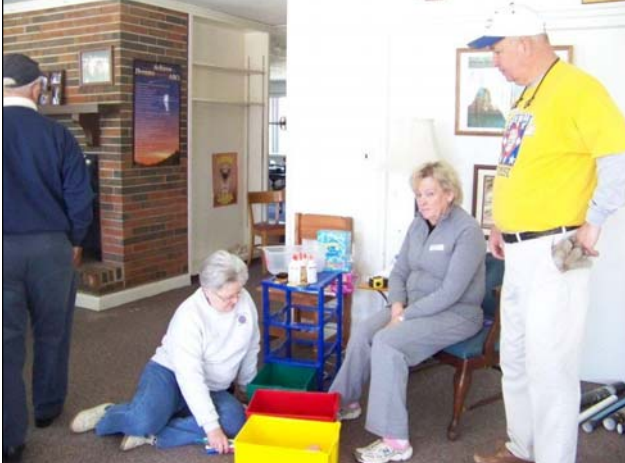
& Girls. We got a lot of work done in the cottage, country store, storage room and

On March 6th we had the Optimist Work Day at the Boys & Girls Home at Lake Waccamaw.As you know we