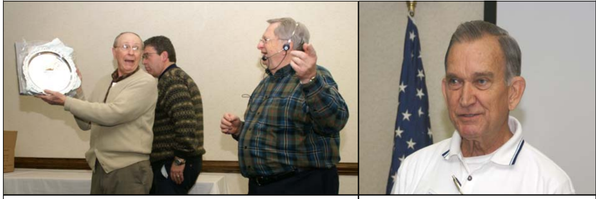
Friday Night Auction at the February Board Meeting netted $1041 for the OI Foundation..

OI FOUNDATION - If you get this newsletter, you probably know how important the OI Foundation is to our district. Much of the program materials that we use and the scholarships we get are provided by the foundation. Our district will get $10,000 in scholarships this year.