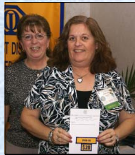
Cape Fear, $20 per member.