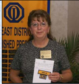
North Raleigh, $20 per member.