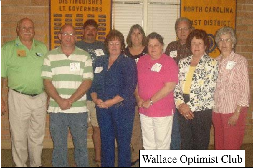
Wallace Optimist Club

Last year in beautiful North Myrtle Beach at our district convention, Governor Auston asked those in training about their commitment to build new clubs in communities which have no Optimist Clubs. Each gave names of communities within their respective zone which would be a great possibility for a new club. Those possibilities are: Zone 1 - Wilmington and Topsail; Zone 2 - Hope Mills and Pembroke; Zone 3 - Kinston and New Bern; Zone 4 - Nashville; Zone 5 - Scotland Neck; Zone 6 - Fuquay-Varina and Durham. The great news is that we now have new clubs in Wilmington and Wallace and the growth team members are working on clubs in Fuquay-Varina and New