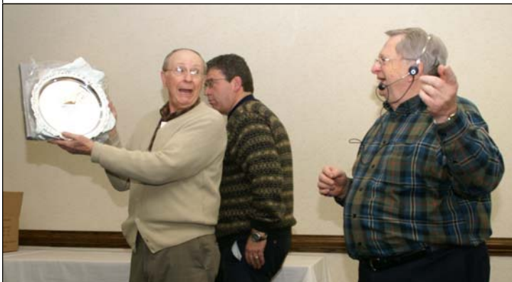
Friday Night Auction at the February Board Meeting netted $1041 for the OI Foundation..

OI FOUNDATION - If you get this newsletter, you probably know how important the OI Foundation is to our district. Much of the program materials that we use and the scholarships we get are provided by the foundation. Our district will get $10,000 in scholarships this year.