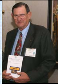
Garner, $20 per member.