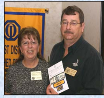
Winter Park, $80 per member.