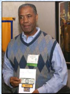
Raleigh, $20 per member.