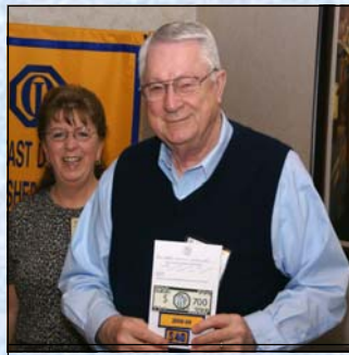
Wilson Evening, $40 per member.