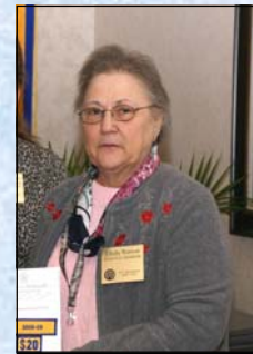
Tarboro, $20 per member.