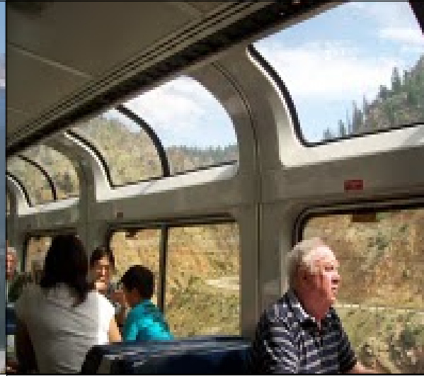
Amtrak to Winter Park