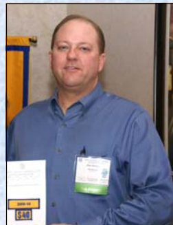
Henderson, $40 per member.