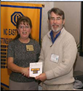
Rocky Mount Eve, $20 per member.