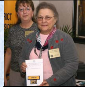
Golden Circle, $20 per member.