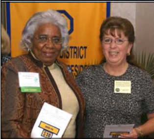
Elizabethtown, $10 per member.