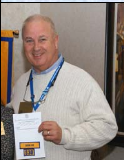
Whiteville, $30 per member.