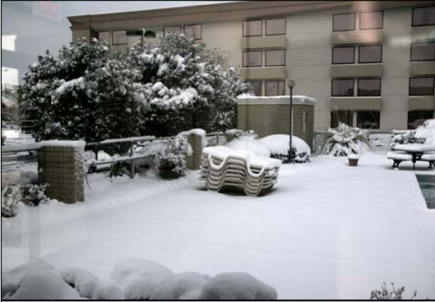
Snow greets the 2 Quarter Board meeting guests.